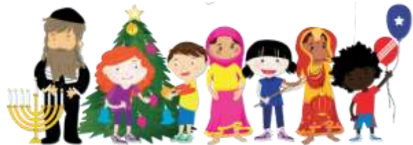
Celebrations around the World