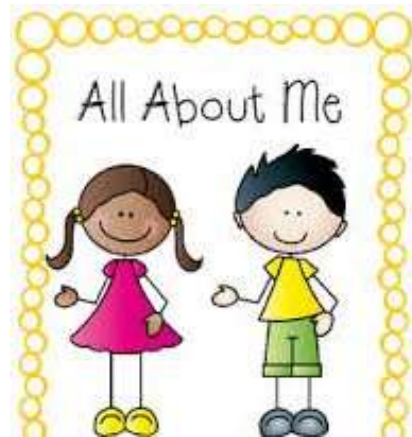
All About Me